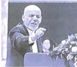
FILE PHOTO: Afghan presidential candidate Ashraf Ghani speaks during the first day of the presidential election campaign in Kabul, Afghanistan, July 28.